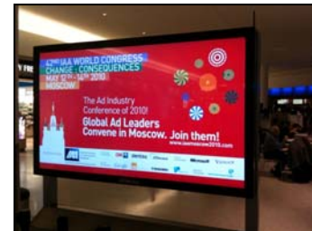
OOH digital advertisement at JFK International Airport

An international TV campaign is scheduled to air globally (ex USA) on CNN International and Euronews. Digital OOH advertisements are now running in London and Moscow and the following airports: JFK, Paris CDG, Miami, Dubai, Hong Kong and Shanghai. And watch for advertisements in the Financial Times and The Economist.