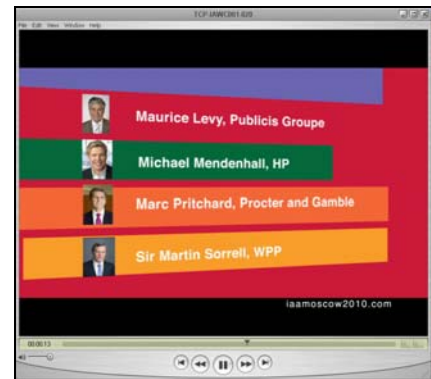
TV Spot, CNN International and Euronews

The global advertising campaign for the 2010 IAA World Congress (visuals shown) included spots on CNN and Euronews. Print ads in the Financial Times, The Economist, Business India and Harvard Business Review. Outdoor in London, Paris, New York, Miami, Dubai, Hong Kong and Shanghai.