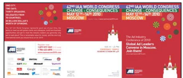
World Congress Brochure

We welcome any suggestions, ideas or information for this newsletter. Visit our website at iaaglobal.org